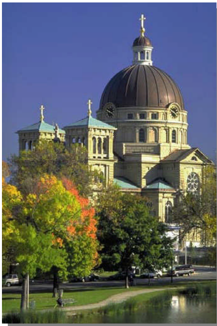
The recently renovated Basilica of St. Josaphat is a social and physical landmark and the only Polish basilica in the United States.

Lincoln Avenue began as a dense commercial street catering to the neighborhood's Eastern European residents. Today, the street is a lively mixture of local and national retail drawing customers from neighboring Hispanic, Asian and Polish communities.